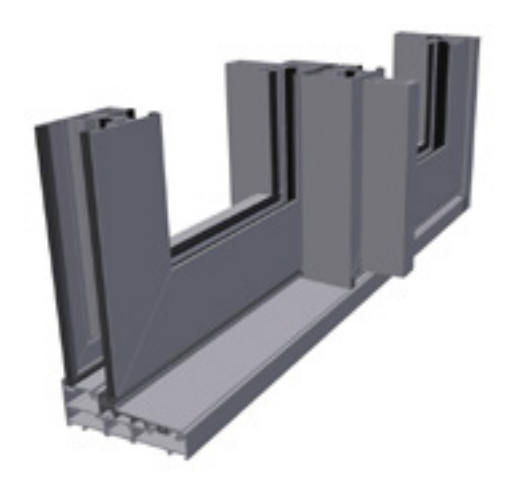
Corner section of the VueSlide 130LS aluminium enhanced threshold with reinforced meeting stile