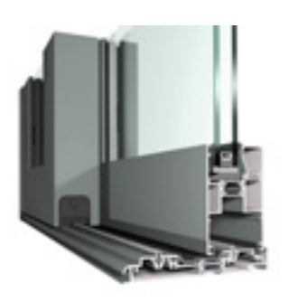
Corner section of the VueSlide 130LS Aluminium low threshold